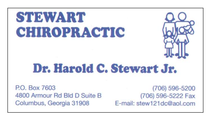
DaVinci Members Receive a 20 % Discount!