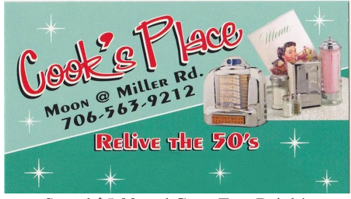
Spend $5.00 and Get a Free Drink!