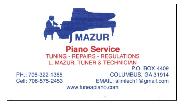
DaVinci Members Receive a $20.00 Discount!

Spend $5, Get 10% Off with code DAVINCI10