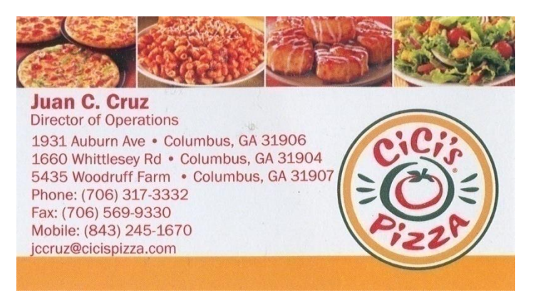
Receive Free Drink with Adult Buffet Purchase!