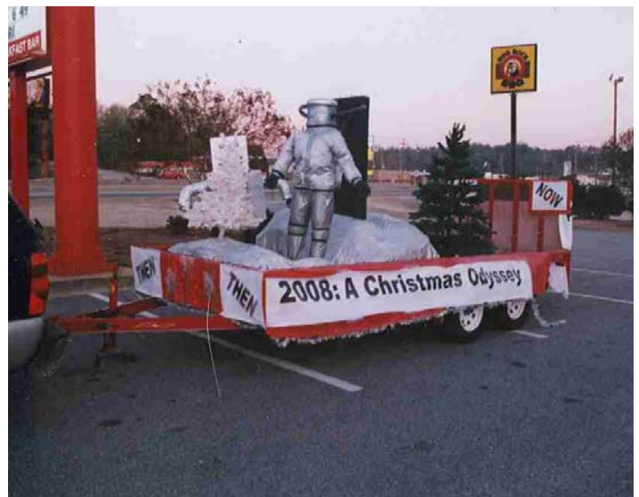
The DaVinci float!

ON MONDAY 19 JANUARY AT 7:00 PM COME FOR THE FOOD AND FRIENDSHIP!