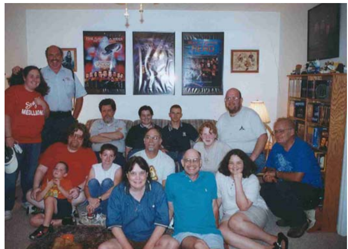
The whole DaVinci kit and caboodle!