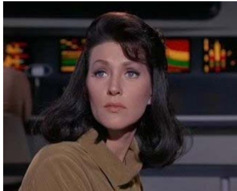
Majel as Number One from "The Cage"