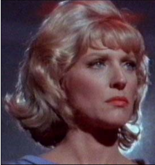
Majel as Nurse Chapel in the Original Series.

acknowledged and appreciated the fact that 'Star Trek' fans played a vital role in keeping the Roddenberry dream alive for the past 42 years. It was her love for the fans, and their love in return, that kept her going for so long after my father passed away," her son said in a statement on the official Roddenberry Web site.