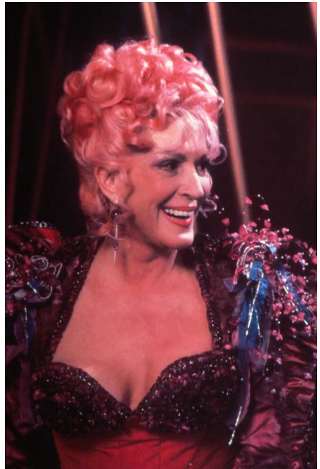
Majel as Lwaxana Troi from the Next Generation and Deep Space Nine.

THE NEXT DAVINCI NIGHT OUT AND MEMBERSHIP MEETING WILL BE AT GOLDEN CORRAL ON MONDAY 19 JANUARY AT 7:00 PM COME FOR THE FOOD AND FRIENDSHIP!