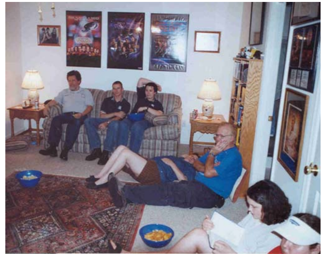
Some of the DaVinci crew and guests at the Stargate SG-1 8 th Season premier party (09 July 2004)

If you have any photographs that you would like to see published in the Pilot, feel free to send them to me with a brief explanations as to who is in the photo and when and where it was taken.