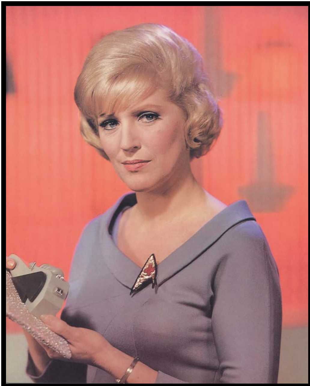
Majel Barrett Roddenberry 23 FEB 1932 – 18 DEC 2008