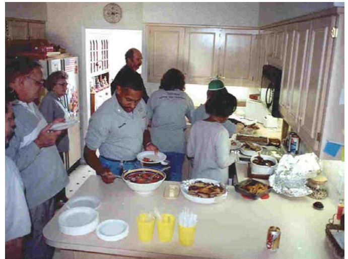
The crew digs in at our Seventh Annual Christmas Party (20 December 2008)

This month’s photos are from our seventh annual Christmas Party. Part II will be next month.