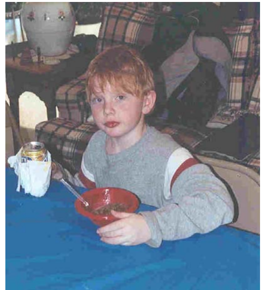
Fonzie, Russell's other grandchild, loves chocolate ice cream as well!