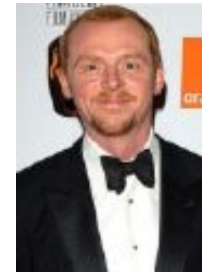
Simon Pegg Scotty