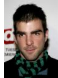
Zachary Quinto Spock