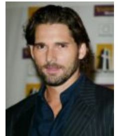
Eric Bana Nero (Villain)