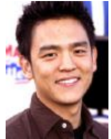
John Cho Sulu