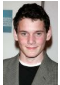
Anton Yelchin Chekov