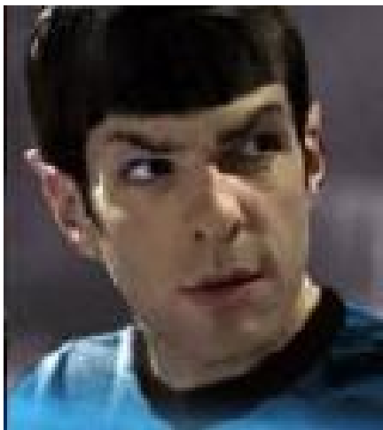
Zachary Quinto as Spock!

THE NEXT DAVINCI NIGHT OUT AND MEMBERSHIP MEETING WILL BE AT APPLEBEE'S (Airport T'way) ON MONDAY 17 MARCH AT 7:00 PM COME FOR THE FOOD AND FRIENDSHIP!