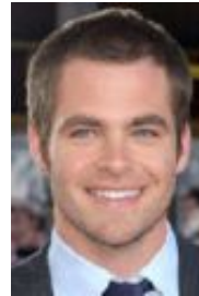
Chris Pine CPT Kirk

What else will you be doing on Christmas day besides opening presents? I hope you will be in line waiting to see the new Star Trek movie! The cast is set, filming has begun, and the web site for the film is up and running ( www.paramount.com/startrek ) where you can watch the exciting new trailer. If you did not already know who the "new" crew is here are the primary cast members: