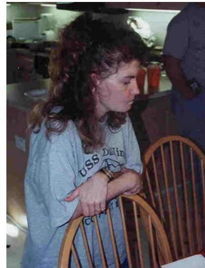
Rose ponders whether she should go back for thirds or is it fourths!