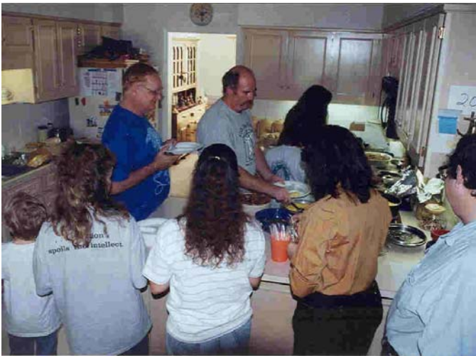
The crew helping themselves to the feast during the DaVinci's eighth annual Thanksgiving Dinner. (22 November 2003)