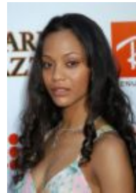
Zoe Saldana Nyota Uhura