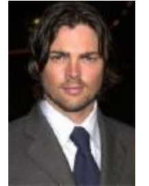
Karl Urban McCoy