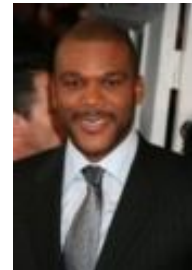
Tyler Perry Head of Starfleet Academy