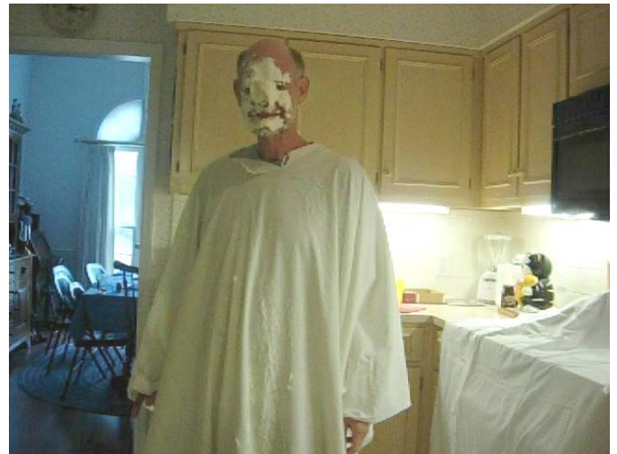
Are we having fun yet?

Mark your calendars for this one! On Sunday March 16th at 1:30 PM the Space Science Center in conjunction with the Columbus Sci-Fi club (formally the Star Wars club) will be having a private showing of the new Stargate SG-1 movie in the Omnisphere Theater! All DaVinci crew personnel are welcomed to attend. There is no charge.