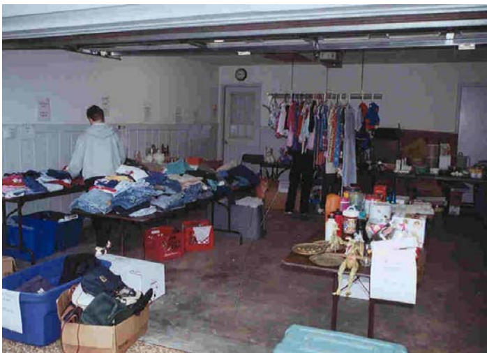
There were lots of goodies on the inside and...