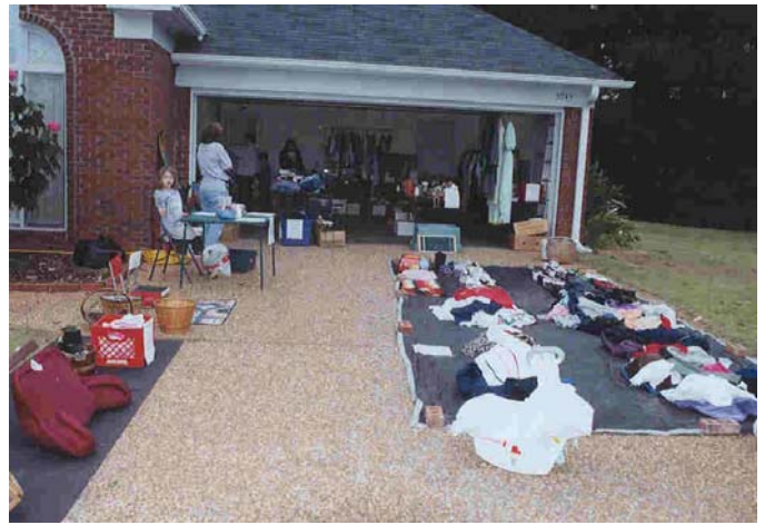
...lots of goodies on the outside!