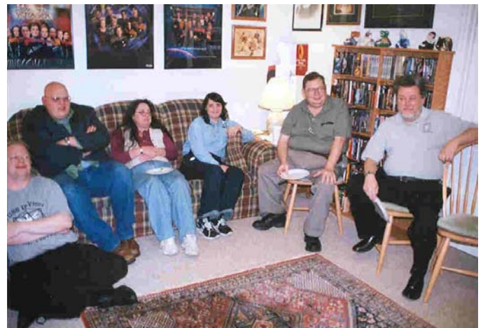
And the crew is certainly enjoying the show!