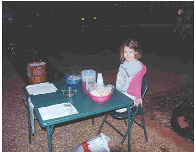
"Would you like to buy some homemade cookies or Kool-Ade?"