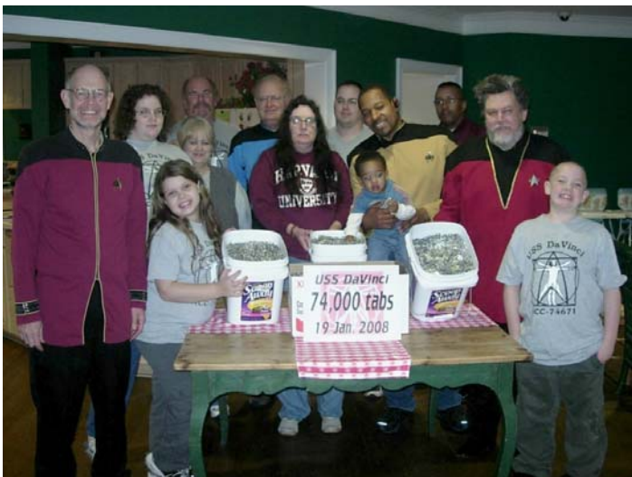
The DaVinci crew at the Ronald McDonald House for the tab turn-in.

The 2008 edition of the Pie Party was a resounding success! We had one of the best turnouts for the breakfast, tab turn-in, and the Pie Party than we have had in quite a while. Twelve crew personnel and two guests joined us for breakfast and the tab turn-in and three more crew personnel joined us for the Pie Party for a total of 17 folks who came not for the pizza or ice cream sundaes but to see the Captain get pied!