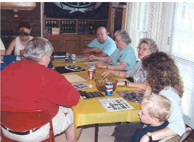
It was not all trivia contest but SPACE: The Game was played as well!