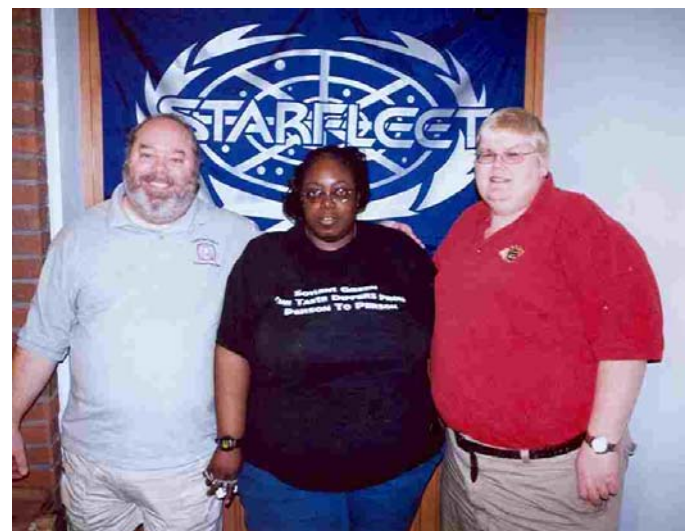
The crew from the USS Atlanta, Atlanta, GA.