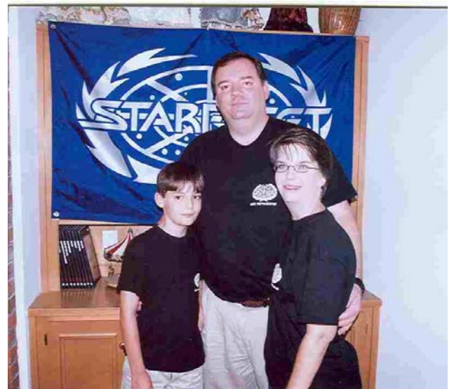
The crew of the USS Hephhaestus, Birmingham, AL.