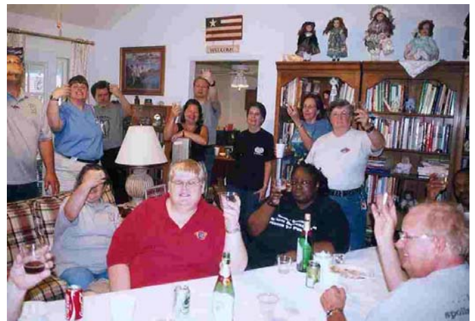
"To the Atlanta! To the Robins! To the Fleet!"

A couple of bottles of Chateau Picard were opened and a toast was made to the two newest chapters in Region 2, the Atlanta and Robins.