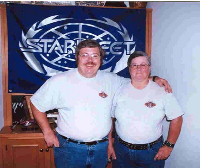
The crew from the USS Robins, Warner-Robins/Macon, GA