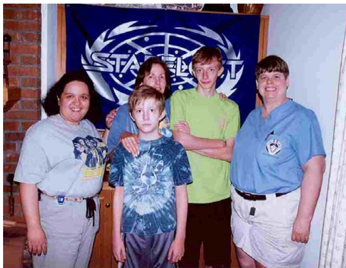
The crew of the USS New Hope, Montgomery, AL.