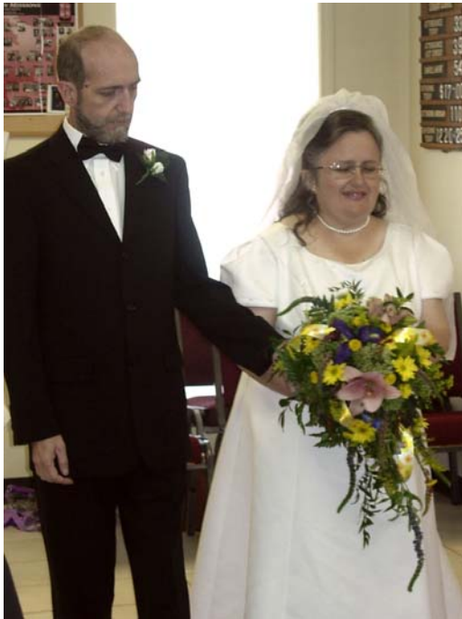
The nervous bride coming down the aisle.

Below are some photographs I took at the wedding.