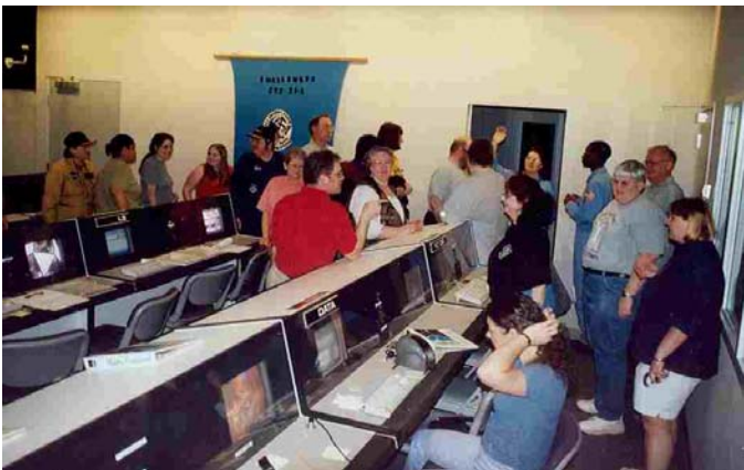
The folks from the DaVinci and Region 2 at the end of the “Mission to Mars.”