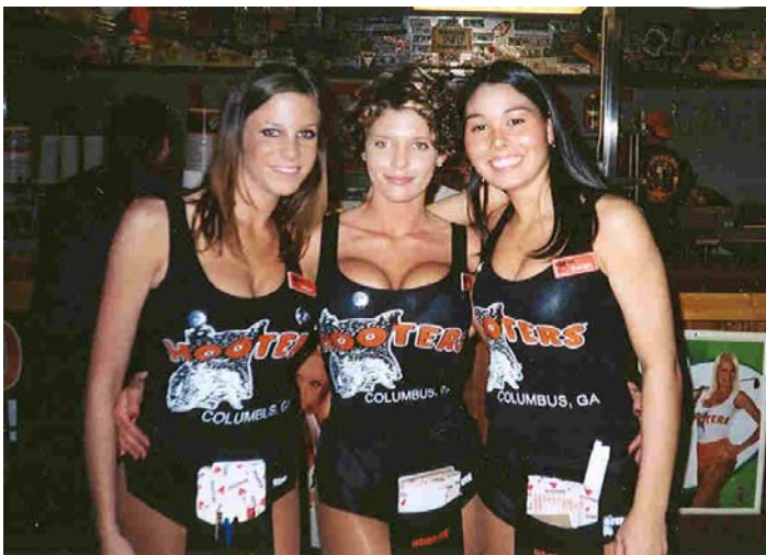
Well, there is no doubt about where this Night Out took place! (17 February 2003)

I thought everyone would enjoy a look down memory lane. Each month I will show a series of photographs from our very beginning, as the Shuttle DaVinci, up until the present time. Many of you will remember these faces. To others they will be complete strangers. But, they made what the USS DaVinci is today. Enjoy! Reminisce.