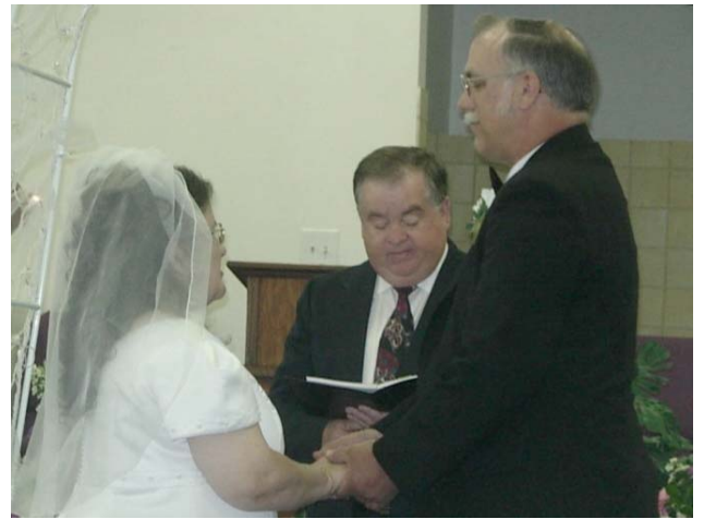
The moment of truth!