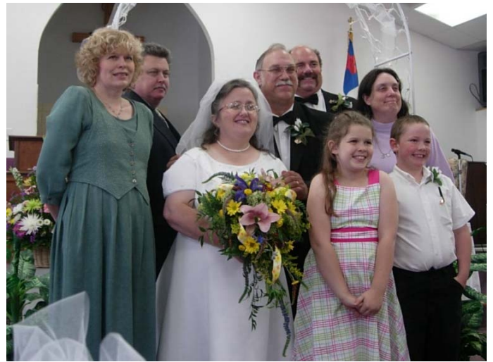
The DaVinci crew in attendance.