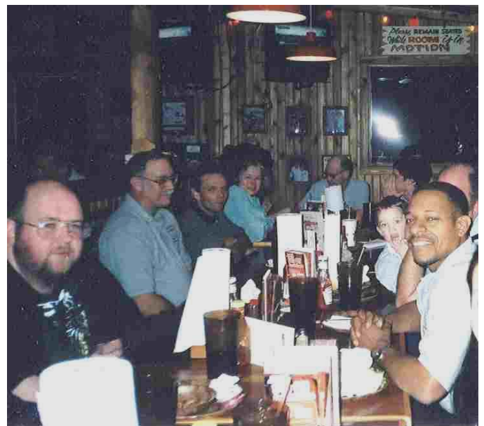
The DaVinci crew enjoying the evening.