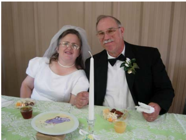
The happy couple taking sustenance after the ordeal.