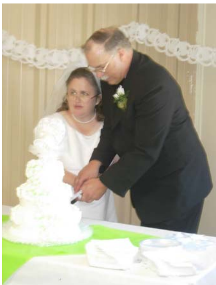
“Let me!” “No, let me!”