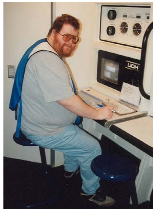
And let us not forget our beloved Rusty!

THE NEXT MEMBERSHIP MEETING WILL BE ON THURSDAY 07 JUNE AT 7:00 PM AT THE RONALD MCDONALD HOUSE PLEASE JOIN US FOR FUN AND GAMES!