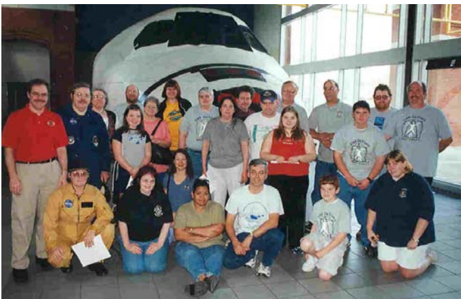
The crew of the DaVinci and the folks from Region 2 pose for the camera following the space mission.