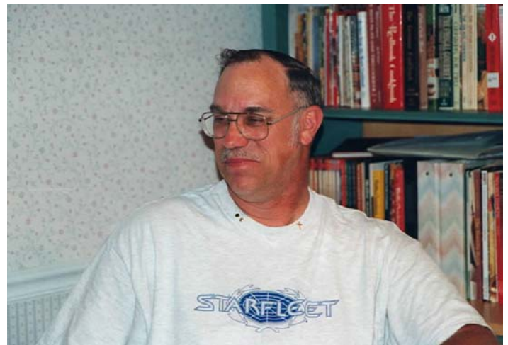
"Humm, one day it will be me leading the crew!"