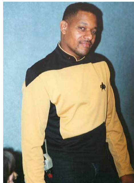
"Am I totally cool, or what!"