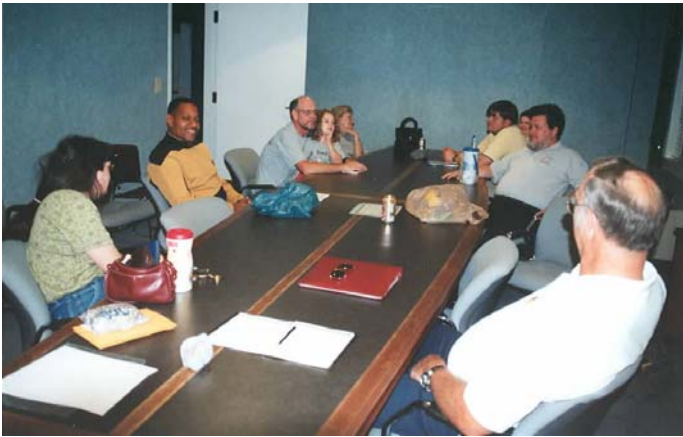
An excited crew attending the very first meeting at the Ronald McDonald House (05 September 2002)