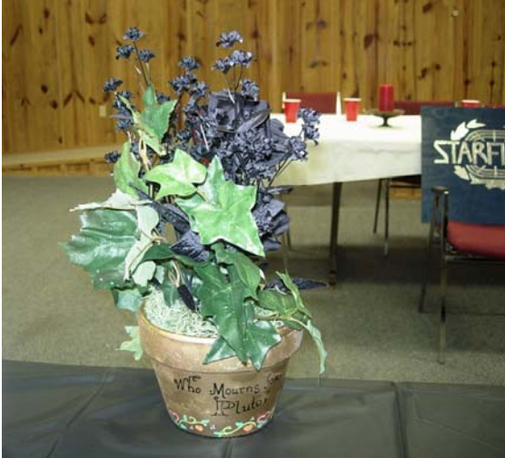
A memorial to the ex-planet Pluto.

The banquet was prepared and served by Starfleet members and was quite tasty. People were to provide their own table decorations. Cadet activities had included tablecloth painting and centerpiece creation, while the Haise crew had a graveyard theme, using the phrase “Who Mourns for Pluto”.