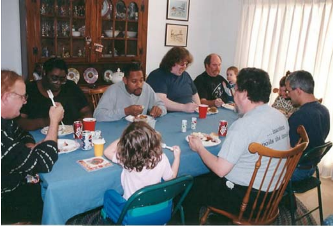
The crew enjoying the good food and fellowship at our 5 th annual Christmas party (15 December 2001)

I thought everyone would enjoy a look down memory lane. Each month I will show a series of photographs from our very beginning, as the Shuttle DaVinci, up until the present time. Many of you will remember these faces. To others they will be complete strangers. But, they made what the USS DaVinci is today. Enjoy! Reminiscence.