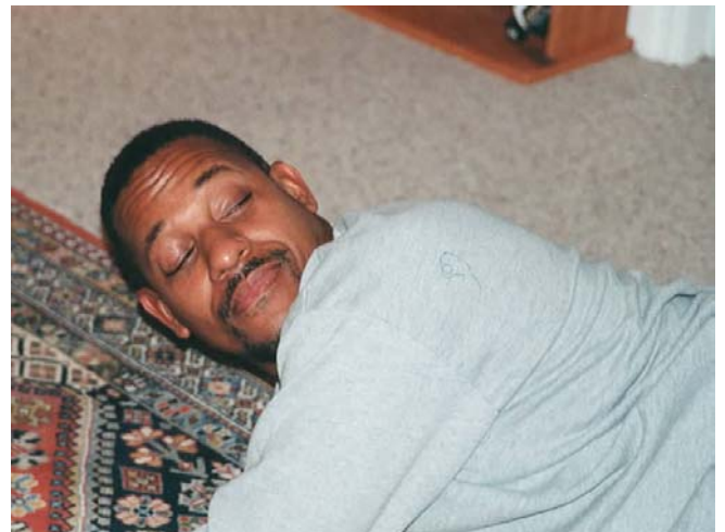
"Ohhhh, way too much ice cream!"