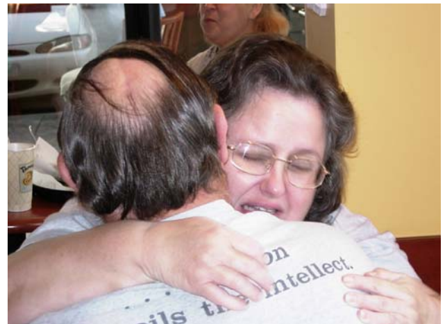
The answer is "YES!"