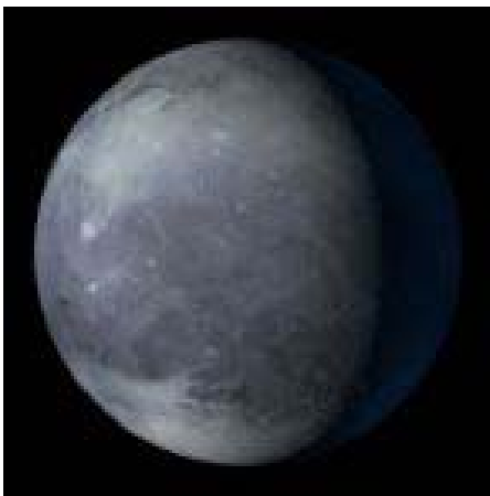
Pluto, shown in happier times.

An 11-year old girl from Oxford, England, suggested the name of the Roman God of the underworld. It was a perfect fit for a planet shrouded in darkness.