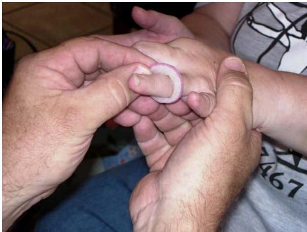
The substitute ring!