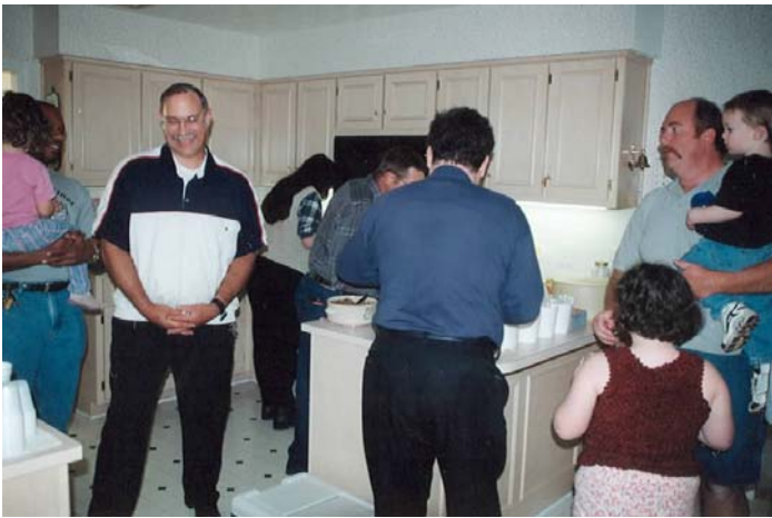
The crew digs in at our Sixth Annual Thanksgiving Dinner (17 November 2001)