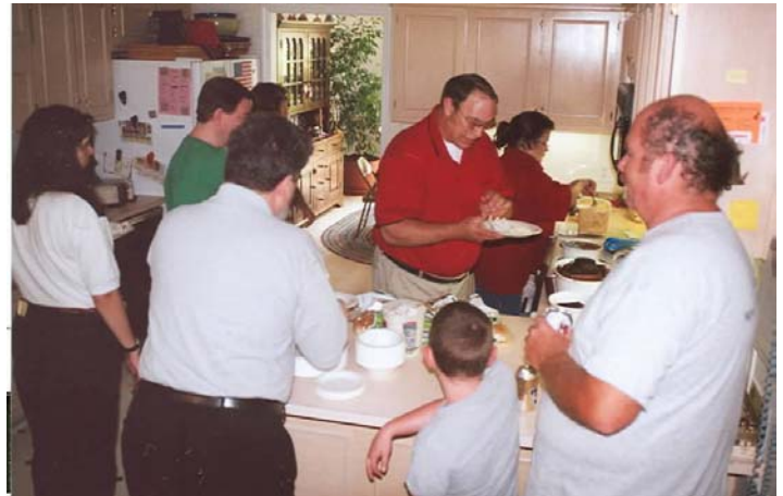
The DaVinci crew digging into the food!