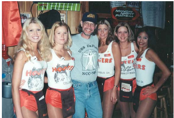
That is much better!