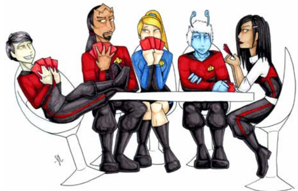
"Know When to Hold'em"