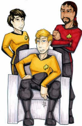
“So We’re Done With Sensible”

The drawing of fanart predates the first written tale of the USS Foreigner. Her first Star Trek sketches began popping up during her senior year of high school and first year of college. “The characters started cropping up in my notes, but they’ve evolved a lot since then. DD-9D7 used to be a girl.”