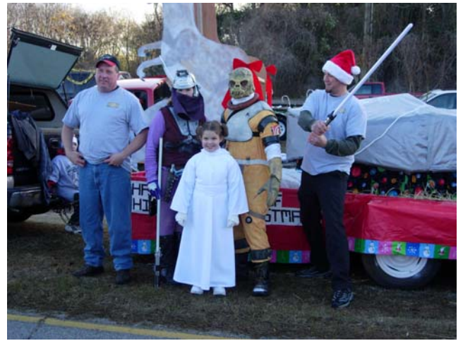
Members of the Fountain City Force along with Princess Leia from the DaVinci pose for the camera.

We did not really believe that our float was going to even be considered for an award when you saw the beauty of all the other floats and then to all our surprise, the judges came by a second time and asked for who was in charge, pulled out the plaque, and told us that we has won 2nd place in the Independent Division!