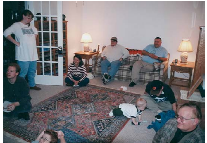
After a full meal, the crew adjourns to the back room to watch television.