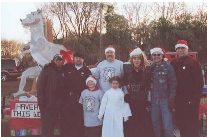
The smiling but cold members of the DaVinci.

Several members of both clubs showed up to participate in the parade, including the locksmith who had to open Frazier's truck when his keys got locked inside at the last moment.