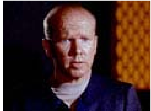
John Fiedler as Hengist in "Wolf in the Fold"

John Fiedler, known to Star Trek fans as Hengist, the administrator of Argellius II who was actually possessed by an evil entity known as Redjac, in the Original Series episode "Wolf in the Fold" has died of cancer. He was 80.