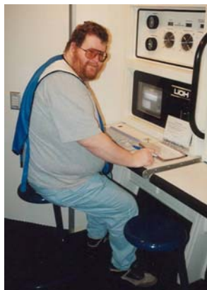
Shuttle Mission (21 Mar 03)