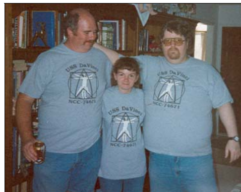
A different kind of R&R squeeze!