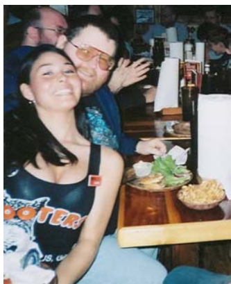
What a smile! (17 Feb 03)