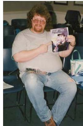
First meeting (15 Feb 95)