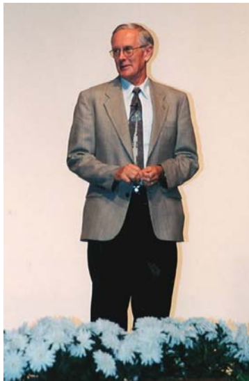
Astronaut Charles Duke (Apollo 16) speaks to the fascinated Columbus State audience (22 July 1999).