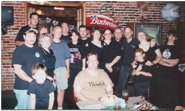
The DaVinci crew enjoying the Deep Space Nine Mourning Party in Hunter's Lounge in the old Hilton downtown. Say, if you recognize the little boy on the left or the first two folks on the left in the back row, please let me know (06 June 1999).