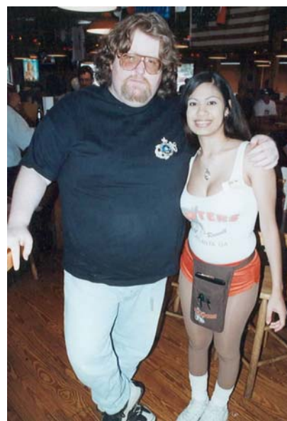
His favorite Hooters girl (he loved her –ah– bottom) at one of his last Da Vinci events (10 July 04)