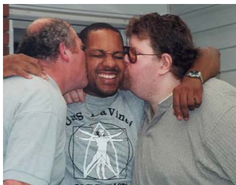
The R&R Squeeze #2! (09 Aug 03)