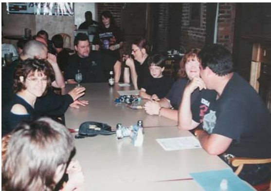
Some of the crew waiting for the food and the beginning of the end for Deep Space Nine (sigh).