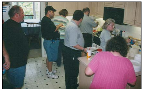
The hungry crew digs in!