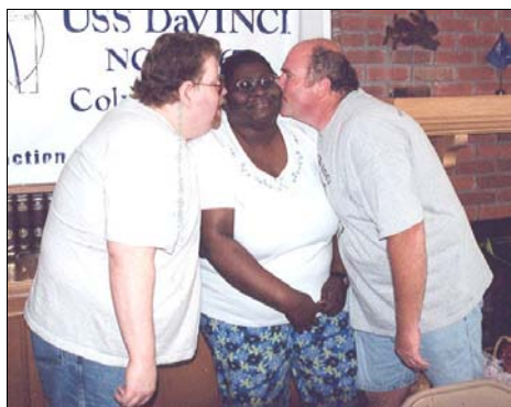
The R&R Squeeze #1 (05 Jul 03)