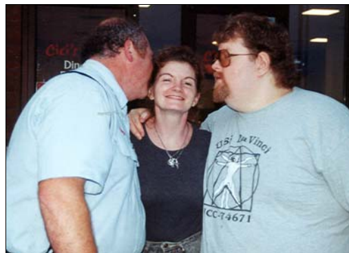
The R&R Squeeze #3 (04 Sep 03)