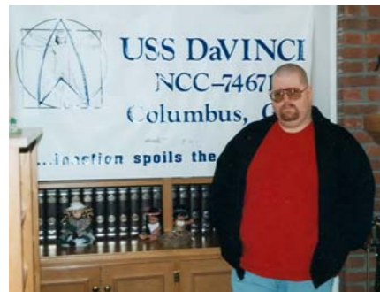
No more "fro"! (23 Nov 02)