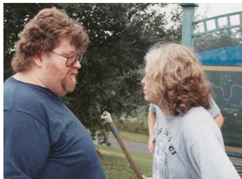
Showdown! (11 Oct 03)

We will always remember you Rusty! Take care.