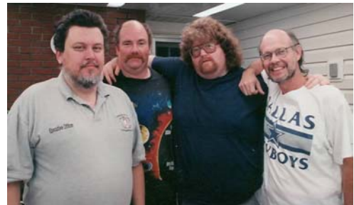
Friends at the pool party (25 Aug 2001)