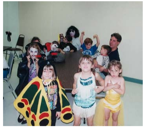
A whole bunch of Cadets pose for the camera.

THE NEXT DAVINCI NIGHT OUT WILL BE AT CI CI'S PIZZA (WHITTLESEY ROAD LOCATION) ON MONDAY JUNE 20 th AT 7:00 PM COME FOR THE GREAT FOOD! COME FOR THE FRIENDSHIP!