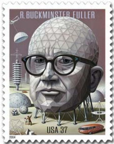
On July 12, 2004, the US Postal Service issued a commemorative postage stamp.

factory assembled. He also designed the Dymaxion car, which was a three wheeled omni directional vehicle that got 30 miles per gallon while transporting 12 people. This was way ahead of its time for the 1930's. One wonders why some of his inventions or designs haven't been adopted as much as one would think. In Fuller's words, "I just invent. Then I wait until man comes around to needing what I've invented."