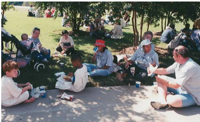
The crew chows down on hot dogs, chips, and Twinkies!