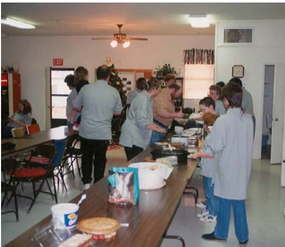
A hungry crowd digs in at our 2 nd Annual Christmas Celebration! (20 December 1997)