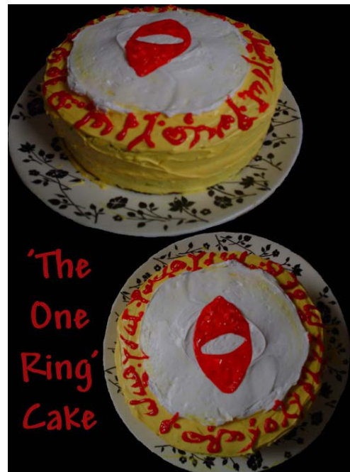
The One Ring Cake! Yum Yum!!