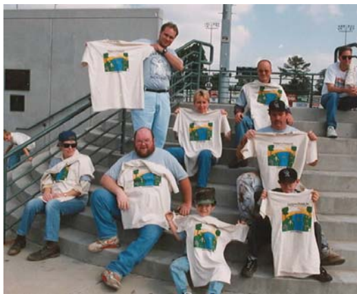
Look what we got!

THE NEXT MEMBERSHIP MEETING WILL BE ON JANUARY 6 th AT 7:00 PM AT THE RONALD MCDONALD HOUSE PLEASE COME.