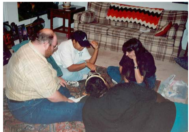
The gang playing – what else! – Chinese Checkers at a membership meeting (18 September 1997)

I thought y'all would enjoy a look down memory lane. Each month I will show a series of pictures from our very beginning up until the present time. Many of you will remember these faces. To others they will be complete strangers. But, they made what the USS DaVinci is today. Enjoy! Reminisce.