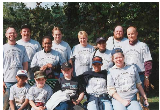
A good turn-out for the very first DaVinci participation in the Help-the-Hooch River clean-up (18 October 1997)