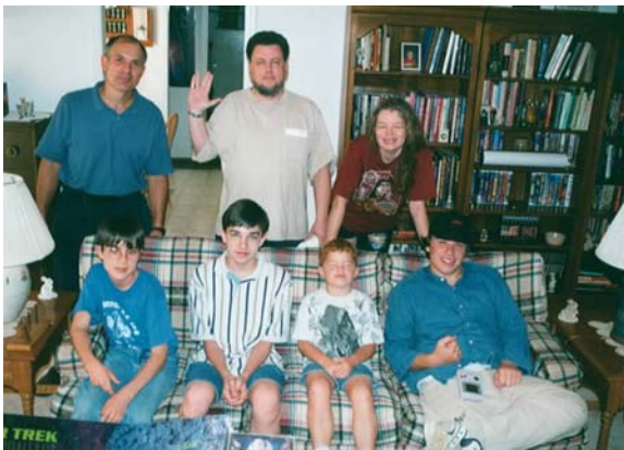
Saturday morning at 11:00 AM!