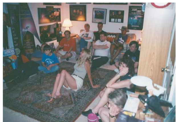
And so it begins, Friday at 7:00 PM.