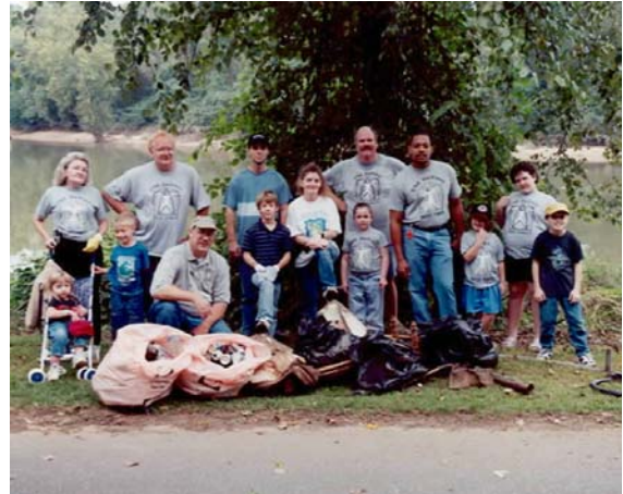
The DaVinci Crew and its collection of trash!

The DaVinci's 8 th annual Help-the-Hooch river clean-up was one of the biggest attended. Over 15 DaVinci crew personnel and their guests helped pick up trash along the banks of the Chattahoochee River Walk. The event itself had nearly 11,000 volunteers, the largest turnout since Help-the-Hooch began! Our section of the river walk had more folks assigned to it than in years past. By the time we started to walk the route, another team was just finishing up. We knew that we could do much better and that prophecy certainly came true by the time we finished 90 minutes later!