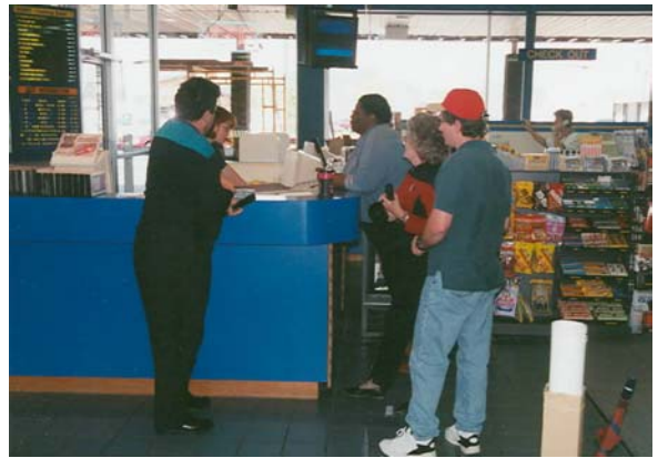
Quick! Rent your copy before they are all gone!