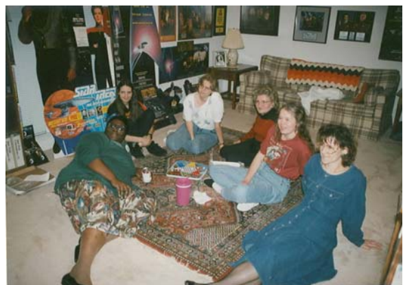
The girls playing Chinese checkers and watching a video at the DaVinci's First Anniversary Party (15 March 1997)

I thought y'all would enjoy a look down memory lane. Each month I will show a series of pictures from our very beginning up until the present time. Many of you will remember these faces. To others they will be complete strangers. But, they made what the USS DaVinci is today. Enjoy! Reminisce.