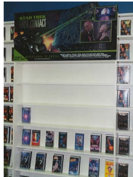
Boy! Do I mean before they are all gone!

THE NEXT MEMBERSHIP MEETING WILL BE ON OCTOBER 7 th AT 7:00 PM AT THE RONALD MCDONALD HOUSE PLEASE COME.